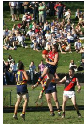
In front of a strong Henson Park crowd North Shore defeated St George in the 2007 Grand Final

8.00am – Second Division 10.15am – Under 18's Challenge Cup 12.30pm – First Division Reserves 2.45pm – First Division Seniors