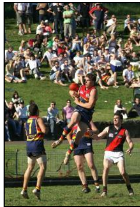
In front of a strong Henson Park crowd North Shore defeated St George in the 2007 Grand Final

Henson Park or Kelso Oval Grand Final (Winner 2 nd Semi Final v Winner Preliminary Final) 8.00am – Second Division 10.15am – Under 18's Challenge Cup 12.30pm – First Division Reserves 2.45pm – First Division Seniors