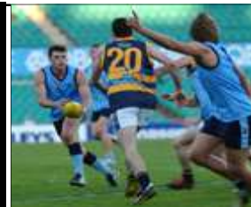
SFL vs ACT @ SCG June 2006

UNSW/ES Bulldogs 19.20.134 def Balmain Dockers 3.3.21