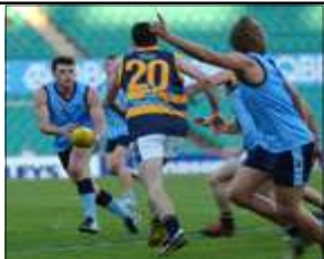
SFL vs ACT @ SCG June 2006

Details of this years Representative Fixture has been finalised. The match against ACT will be played on Sunday, June 10 at Manuka Oval commencing at 2pm. The squad will travel to the nations capital on Saturday, June 9 and return on Monday, June 11.