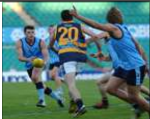
SFL vs ACT @ SCG June 2006

Details of this years Representative Fixture has been finalised. The match against ACT will be played on Sunday, June 10 at Manuka Oval commencing at 2pm. The squad will travel to the nations capital on Saturday, June 9 and return on Monday, June 11.